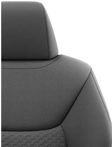
Black fabric upholstery with light grey roof lining (Luna) (FB20)