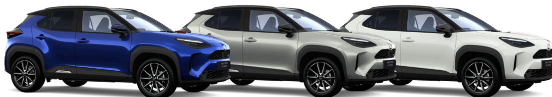
Juniper Blue Bi-tone (M20) **