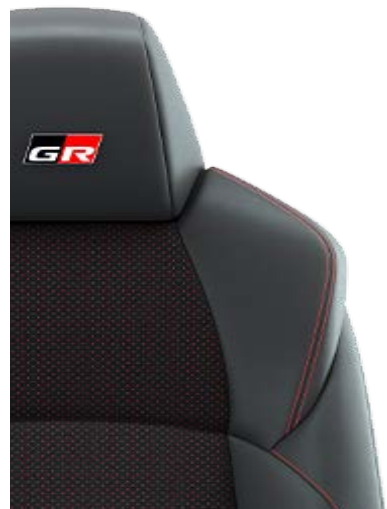
GR SPORT suede and synthetic leather upholstery with red stitching (GR SPORT) (EC20)