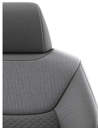
Black fabric upholstery with light black roof lining (Luna Sport) (FC20)