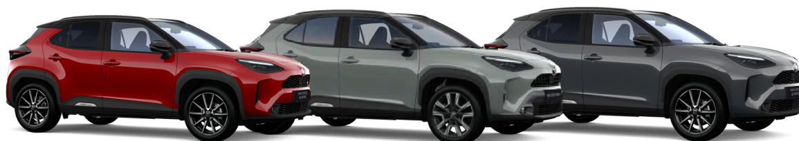
Pearl Red Bi-tone (2SZ) *** *GR SPORT Only*