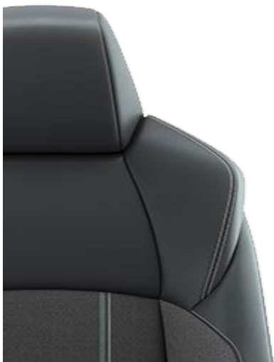
Black fabric and synthetic leather upholstery with grey stitching (Sol) (EA40)