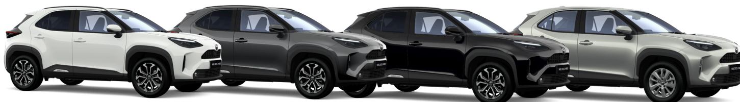
Pure White (040) *