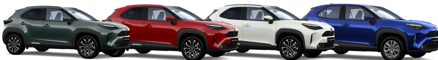
Forest Green (6X7) **